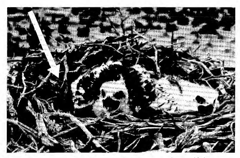
Figure 2. Ferruginous Hawk nest showing 1.3 cm steel cable interwoven with coarse sticks in nest.